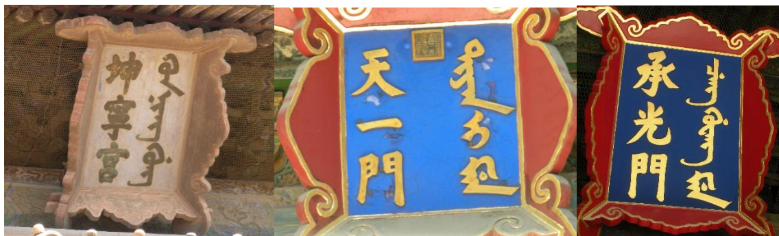
Above, examples of modified Syriac, old Uyghur, inscription on various temples in Beijing, China.

The old Uyghur alphabet was used as the Uyghur's Turkic language from the 8 th or 9 th century which is influenced by the Syriac alphabet of the Church of the East because of the said church missionary work. This continued until around the 18 th century. This language was spoken in Turpan and Gansu in northwestern China, and it is considered as the ancestor of the modern Uyghur language. Interestingly, the old Uyghur alphabet that was developed from the Syriac (Aramaic) alphabet is written from left to right and in vertical columns unlike Syriac, which is written from right to left in horizontal lines.