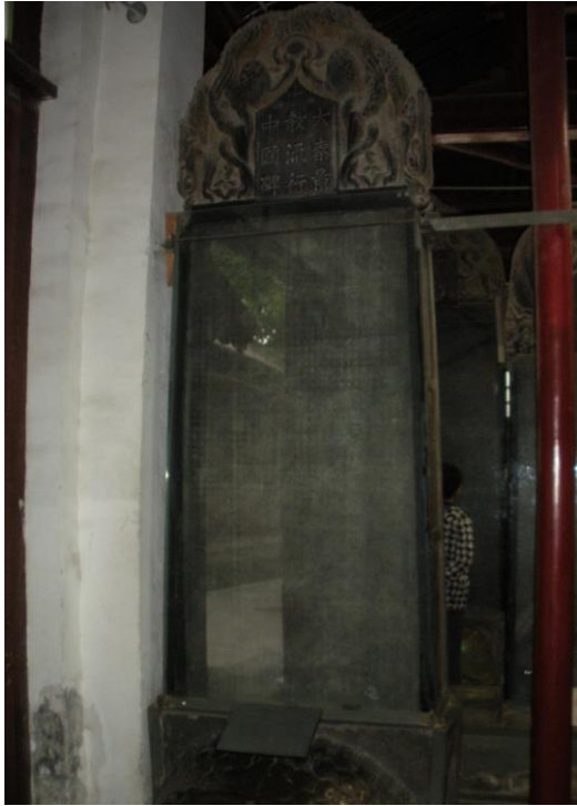
Above, photo of the Nestorian Monument in Xian, China. Below, photo of Syriac inscription on the replica of the monument erected on Mt. Koya, Japan.